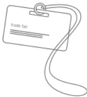
Trade Fair Video

Our know-how from concept to finished production turns your project into effective advertising entertainment.